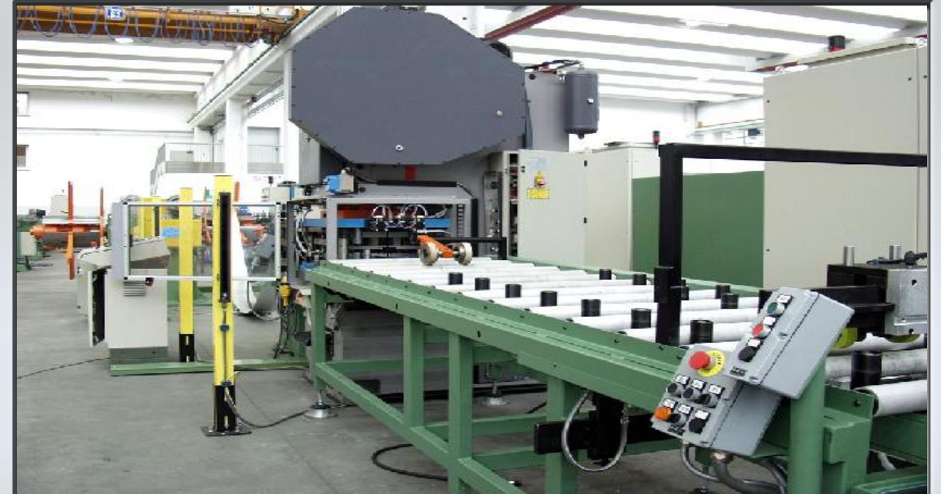
View of press and motorized conveyor

36023 8 WIRE MESH ACCIDENT PREVENTION BARRIERS